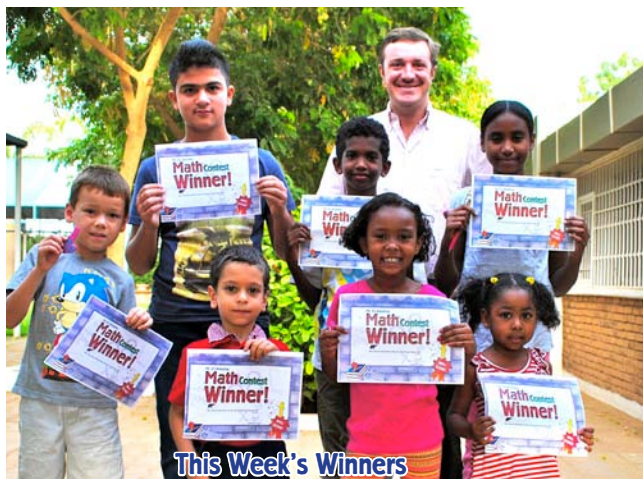
This Week's Winners

Solutions from the last week: Kindergarten: 17; Grade 1: Answers will vary; Grade 2: 81; Grade 3: 45; Grade 4: Yes (5.5 each); Grade 5: 1 and \frac{1}{2} gallons; Middle & High School: -31, -63, -127;